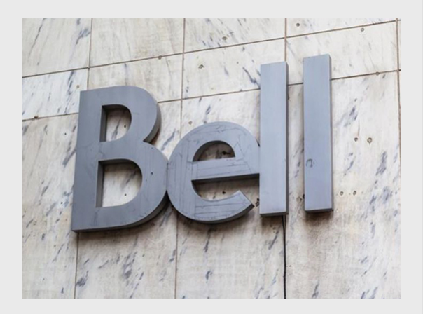
Unifor condemns Bell Canada executives for awarding themselves more than $5 million in bonuses during massive job cuts.