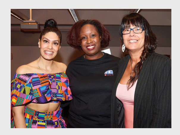
Unifor members in Metro Vancouver celebrated Black History Month with solidarity, guest speakers, and steel drum music.