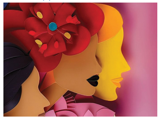
International Women's Day is March 8. March, rally, organize, and rise