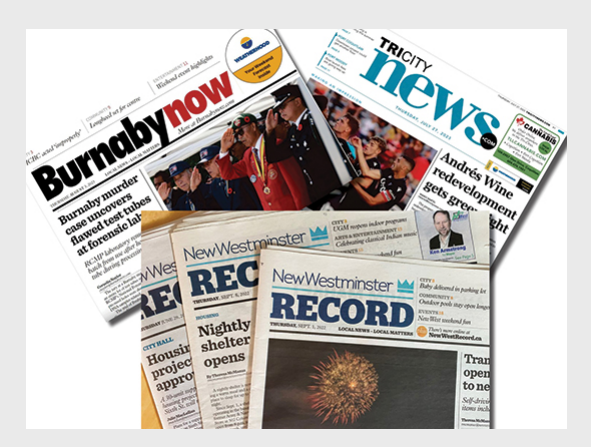
Glacier Media's closure of multiple digital community newspaper will contribute to the "news deserts" in Metro Vancouver.