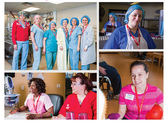
Health care workers: Share what you love about your job and be part of Unifor's Health Care Worker Week!