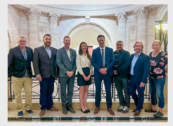
Unifor met with Manitoba Ministers to advocate for the protection and expansion of energy sector jobs and to address the critical issue of fugitive methane emissions.

Unifor has requested an urgent meeting with Nfld. and Labrador Premier Andrew Furey to discuss the fate of the Telegram's printing press as it is left out of the Postmedia acquisition.