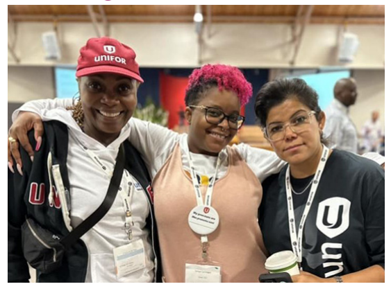
The deadline for applications to the Local Union Equity Fund is fast approaching. The fund was created to encourage local unions to dedicate time and resources to equity campaigns and initiatives.