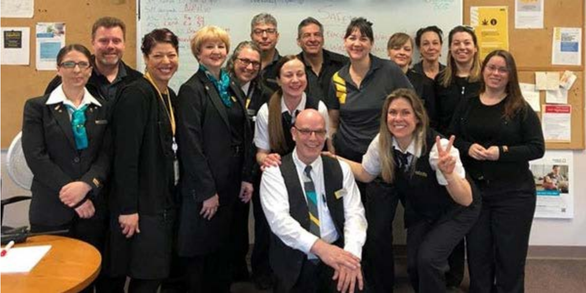
Unifor plans to aggressively fight back against the federal government's plan to privatize the VIA Rail corridor.